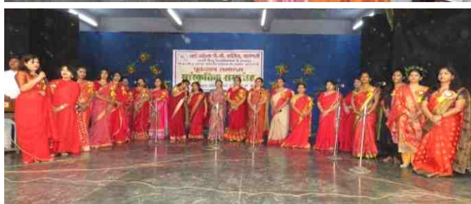
मेघा सांस्कृतिक संकुल महोत्सव