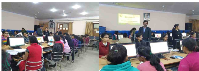
पूर्वच्छात्र समागम (Alumnae Meet - 2019)