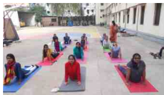
Bhujangasana (Cobra Pose)